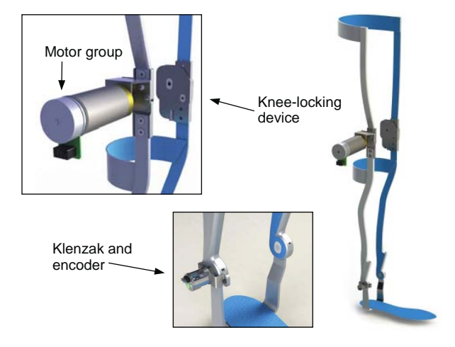
Fig. 1. CAD design of the first prototype of active KAFO.

The main modifications to the current devices suggested by the medical staff of the SCI Unit at CHUAC were the following ones: a) introducing, besides the locking system, actuation at the knee joint because the considered subjects do not have enough muscle force to flex and extend the lower limb during the swing phase; and b) including some additional sensors on the prototype or the body in order to better control the knee-locking system and actuation.